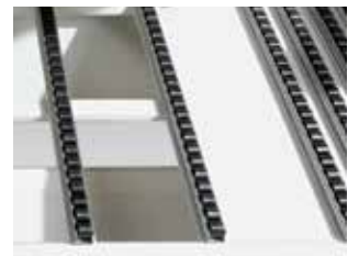
Rollers on arms of pneumatic sheet support