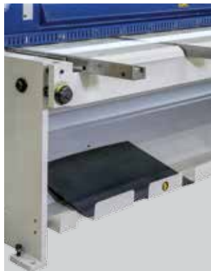
Sheet shute to bring cut plates to the front