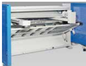
b) Sheets to the back