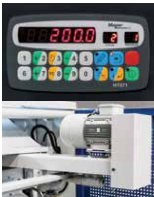
High quality programmable digital NC controller