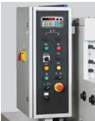
Control panel and electrical circuit in the same cabinet for easy reach