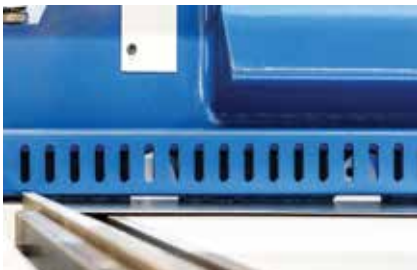
Rubber pads under holddown to avoid any marks or scratch on sheets