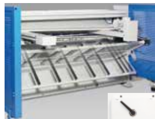
c) Sheets to the back or front with user setting