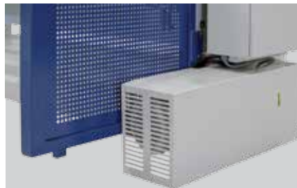
Motor mounted outside the machine frame to leave a totally free area under the table