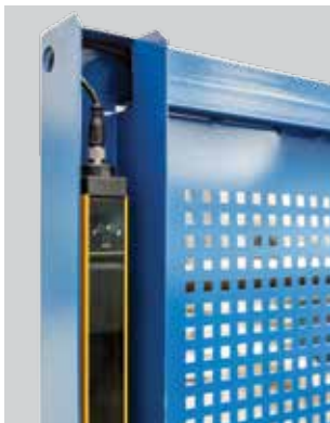
Full CE conformity protection with multi-beam light barriers and enclosures