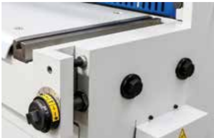
Two sided blade gap adjustment with position indicator