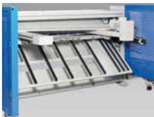
a) Sheets to the front

Pneumatic rear sheet support with three different executions