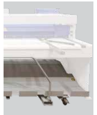
Sheet wagon movable on wheels