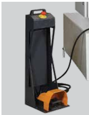
Foot pedal console with emergency stop button and hand grip