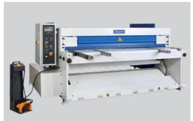
The RMT with its robust construction allows the users to get precise cuts without twists even on narrow strips