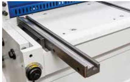
Squaring arm with scale